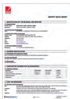
Safety Data Sheets

For more than 25 years, Northfork has been manufacturing quality cleaning chemicals at its manufacturing facility in NSW. From food service hygiene, to housekeeping and washroom, personal hand care and laundry washing products, Northfork is ideal for the home and workplace environment. To help ensure the user is safe and well-educated on chemical use, the Northfork range is accompanied by a complete suite of reference material including safety data sheets, usage guidance, wall charts and where to use support sheets.