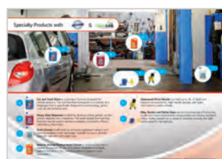
Where To Use Guides

Accompanying our chemical range is Cleanlink cleaning accessories. Cleanlink products are designed to make cleaning easy. A select range of Cleanlink products incorporate an industry standard colour coding system, this system makes it even easier to allocate the correct cleaning tool in your establishment.