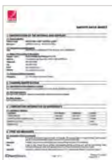
Safety Data Sheets

For more than 25 years, Northfork has been manufacturing quality cleaning chemicals at its manufacturing facility in NSW. From food service hygiene, to housekeeping and washroom, personal hand care and laundry washing products, Northfork is ideal for the home and workplace environment. To help ensure the user is safe and well-educated on chemical use, the Northfork range is accompanied by a complete suite of reference material including safety data sheets, usage guidance, wall charts and where to use support sheets.