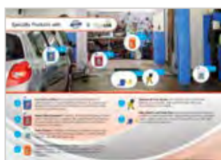
Where To Use Guides

Accompanying our chemical range is Cleanlink cleaning accessories. Cleanlink products are designed to make cleaning easy. A select range of Cleanlink products incorporate an industry standard colour coding system, this system makes it even easier to allocate the correct cleaning tool in your establishment.