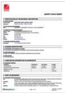
Safety Data Sheets

For more than 25 years, Northfork has been manufacturing quality cleaning chemicals at its manufacturing facility in NSW. From food service hygiene, to housekeeping and washroom, personal hand care and laundry washing products, Northfork is ideal for the home and workplace environment. To help ensure the user is safe and well-educated on chemical use, the Northfork range is accompanied by a complete suite of reference material including safety data sheets, usage guidance, wall charts and where to use support sheets.