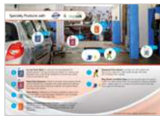
Where To Use Guides

Accompanying our chemical range is Cleanlink cleaning accessories. Cleanlink products are designed to make cleaning easy. A select range of Cleanlink products incorporate an industry standard colour coding system, this system makes it even easier to allocate the correct cleaning tool in your establishment.